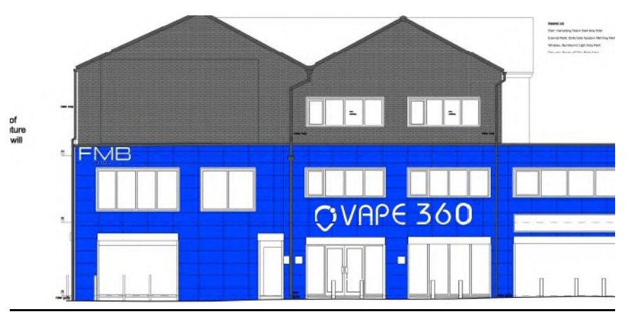
View of proposed side elevation (Sagar Street)

Originally, the site would have been occupied by a building of the scale and roof pitch proposed, albeit with a lesser depth. The extension has been set back from the original building so it sits on the inner leaf of the cavity walls to clearly define the extra storey as a later addition.